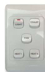
5 Gang Rocker Bakelite Wall Switch